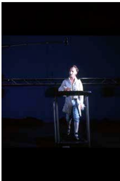
On set at the Studio National du Fresnoy, 29 April 1999.

Ragtime is so named because of its ragged, syncopated and lively beat.